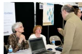
A close listening

That event allowed over 400 people with disabilities looking for a job to meet with employers who needed manpower.